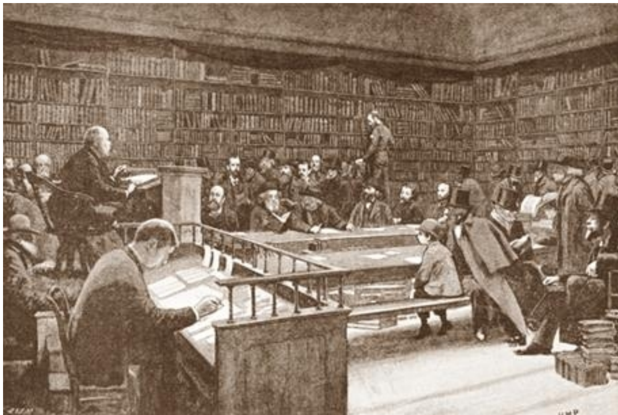
Sotheby's first-ever sale was that of a library of several hundred scarce and valuable books in all branches of literature.