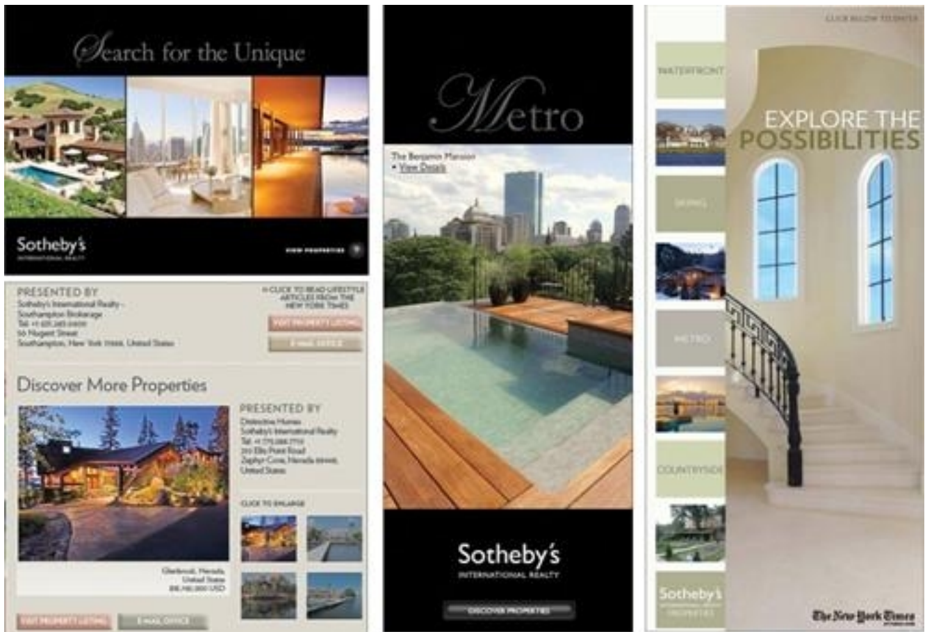
Featured above: Real Estate and Great Homes Slideshow, Custom Expandable Units, and Banner Ad